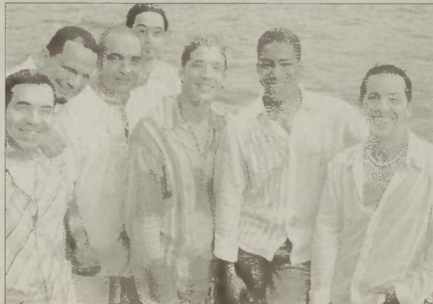
N.C. BLUMENTHAL PERFORMING ARTS CENTER

Tempo Libre will perform its musical mix of Latin jazz that stays true to the group's Cuban roots March 31 at McGlohon Theatre.