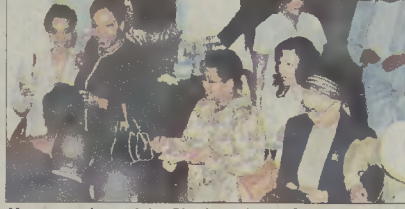
More attendees of the Charlotte Post POP awards.

The Charlotte Post Can be delivered to your house Call 704 376 0496 today