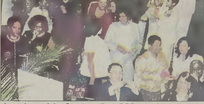
Attendees of the Charlotte Post POP awards.