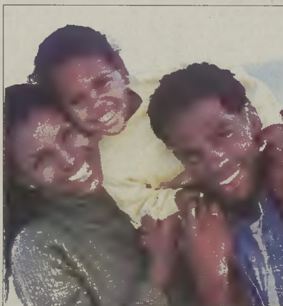
THE STOCK MARKET

Bishop TD Jakes doesn't want to give up on the traditional black family and wants others to adopt the same mind set.