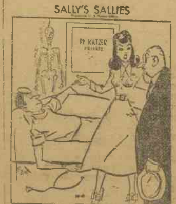
"The Doctor is simply exhausted after prescribing so much rest to so many patients."

The professor looked - as his watch and replied: "Never mind, young man. Your patient has been dead for forty seconds."