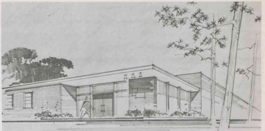
SCHOOL OF PRINTING EXTENSION — This is the architects' sketch of the extension to the Roy Parker School of Printing's building, one of the seven structures in Chowan College's development program. This would make the second addition to the original building since 1953. More floor space is needed for additional machinery to accommodate a larger enrollment in order to meet the demands from newspaper publishers for the school's graduates.

To our critics we would suggest that you take time to visit our meetings each Monday evening in the Graphic Arts building. Give us your help, your advice. If you can do