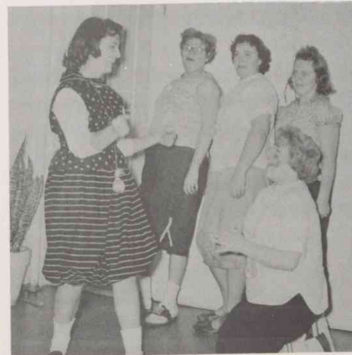
"We Love Thee, Sophomores," sing these freshman rats.