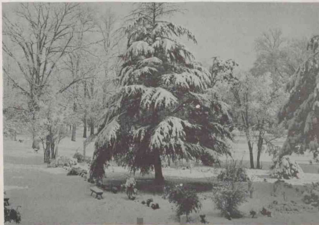
AND THE SNOW CAME—Chowan's beautiful campus was a picture to attract any artist following the recent snow storm. This is but one of many spots that attracted the eye.

The concert played by the National Symphony Orchestra of Mexico was one that not many of its spectators will forget, for it was a first for many of them.