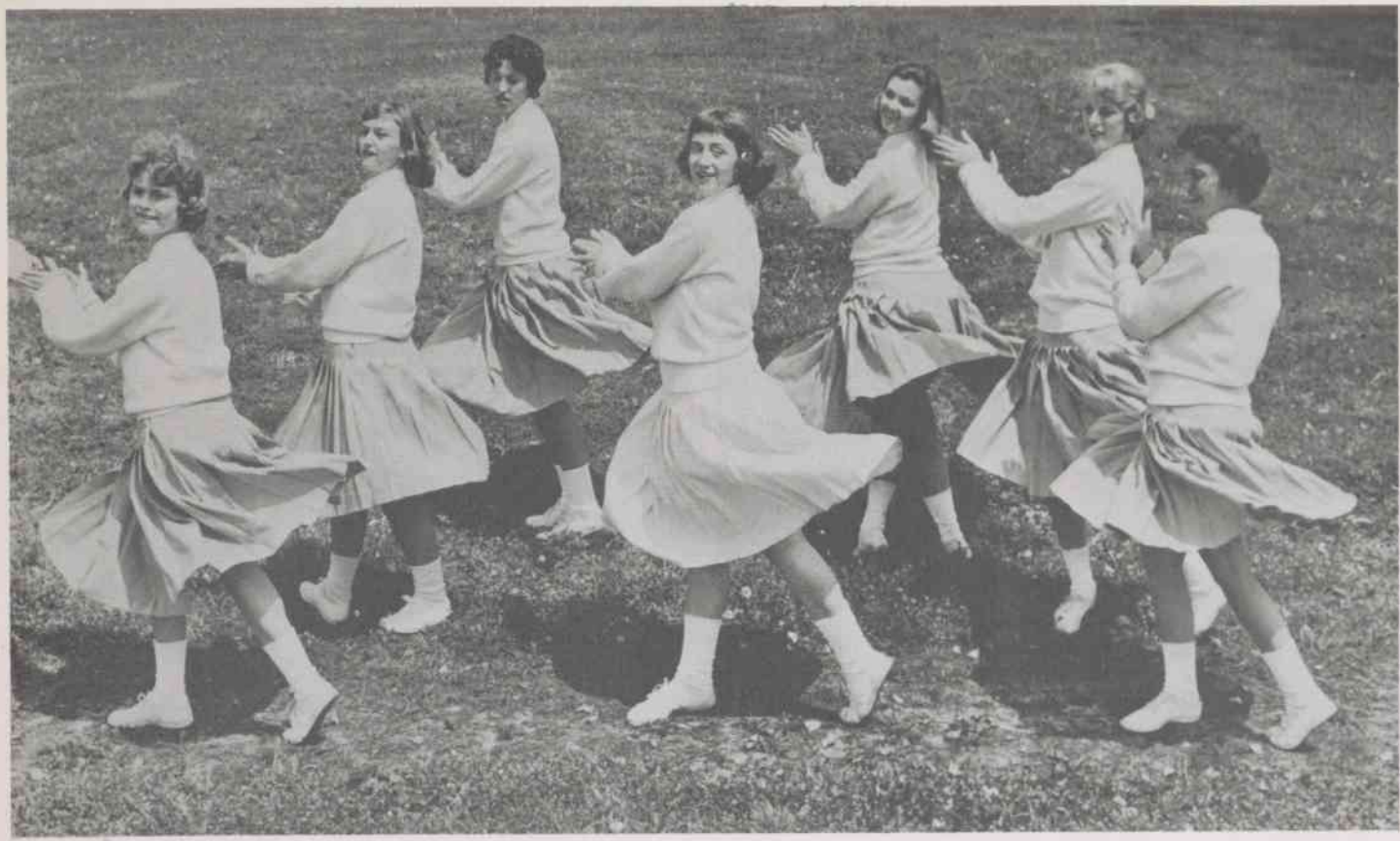
VIM, VIGOR AND BEAUTY - These pretty co-eds, with whirling skirts, play a great part in boosting team moral and urging Chowan athletes to become fighting teams. The attractive