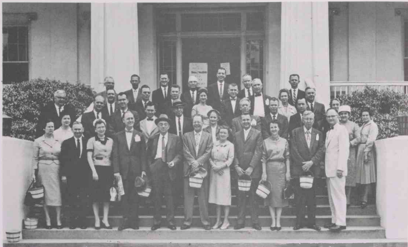
MEMBERS OF THE PRESS — On the steps of the Columns building are the members of the Eastern North Carolina Press Association, administration and faculty members of the college, and other guests who were in attendance at the April 30 press