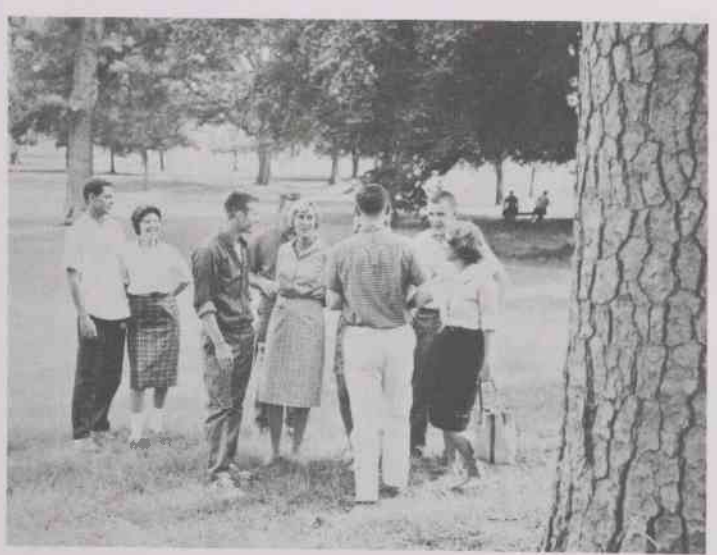
Freshman and Sophomores get acquainted