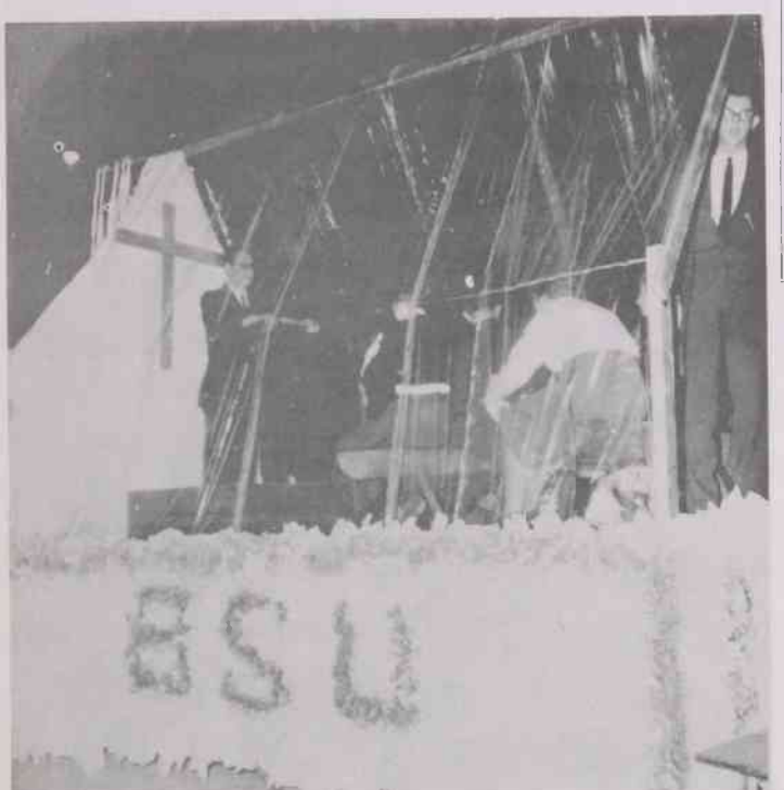
BSU FLOAT was winner of first prize in the float contest