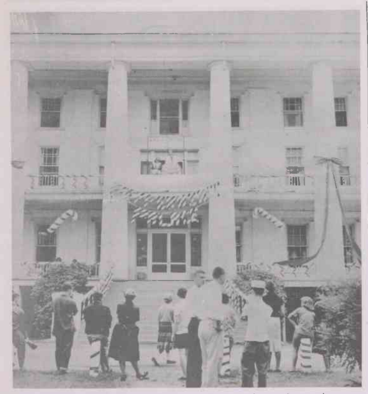
FIRST PRIZE WINNER - "The Peppermint Palace", better known as the "Columns", won first in the dorm decoration contest.