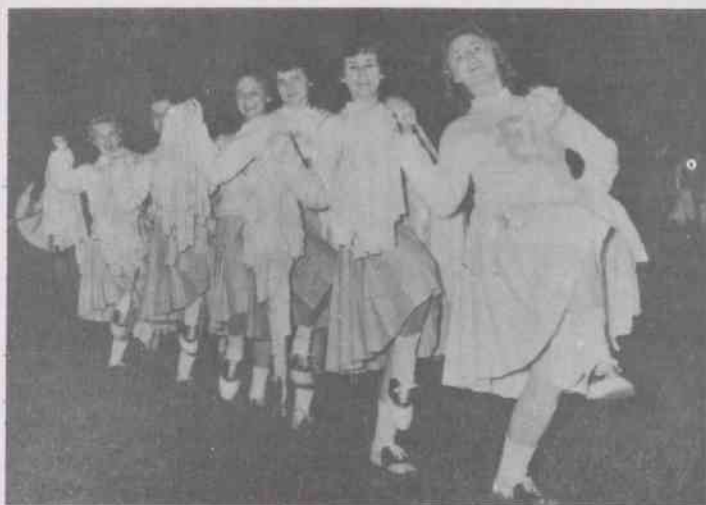
CHOWAN CHEERLEADERS PRANCE