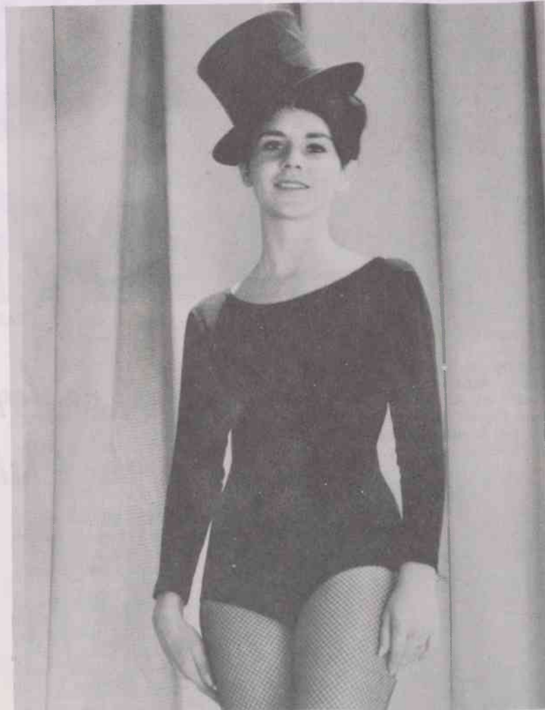
A vibrant young lady bounces into action.

These winners will reign over annual May Day pageantry at Chowan College on May 6.