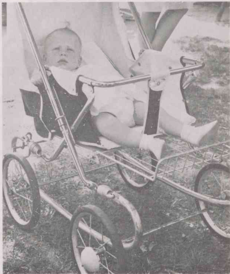
EVERYBODY PAYS ATTENTION during special campus activities.