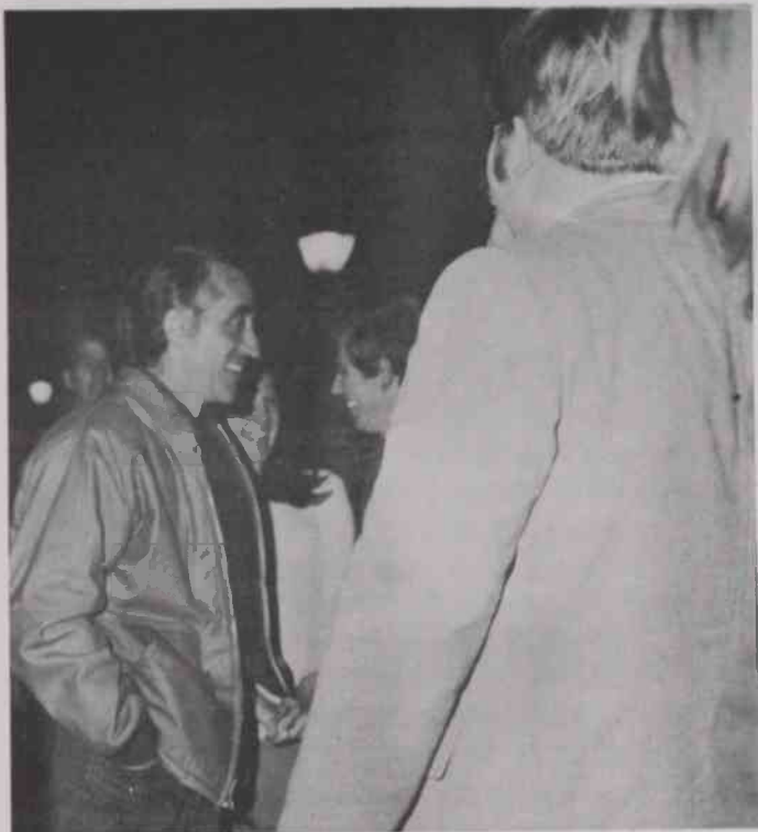
Former Presidential candidate chats informally with students after performance in McDowell Columns.