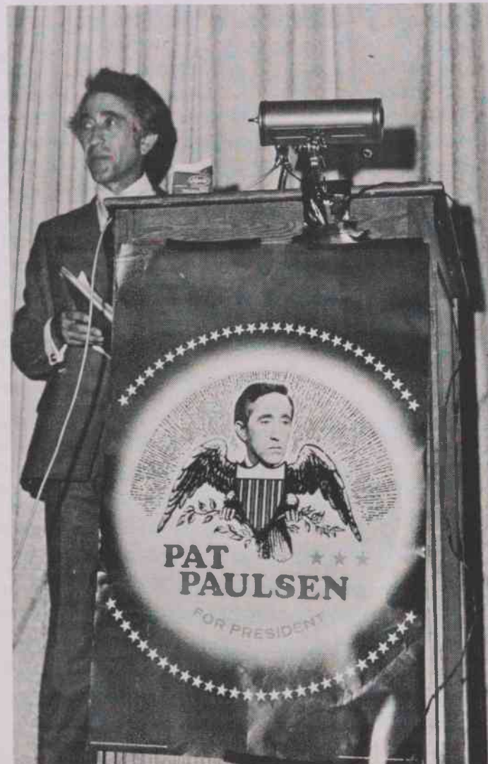
Presenting his Presidential Platform for Nomination by the Straight Talking American Government (STAG).

Each basket contained a turkey, ham, assortment of fruit, and biscuits. Many of the students donated canned goods as well as money and they were included in the baskets.