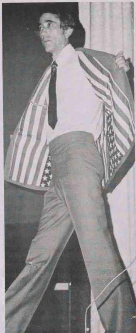
Famous TV Personality Shows His "Colors."

The lectures by the famous TV personality were conducted at 8:00 p. m. in the evening, and admission was free to Chowan College students. After the performance, Paulsen chatting for sometime informally with admirers who crowded the stage seeking autographs and to get a closer look at the performer.