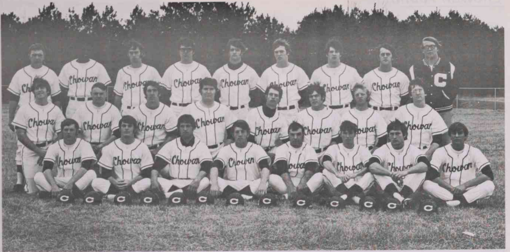
The 1972 Chowan Baseball Squad