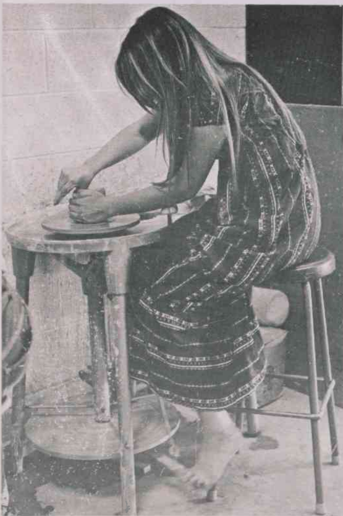
POPULAR COURSE —Many students are finding the classes in ceramics to be interesting and valuable. This young student appears to be concentrating on her project at the potter's table.