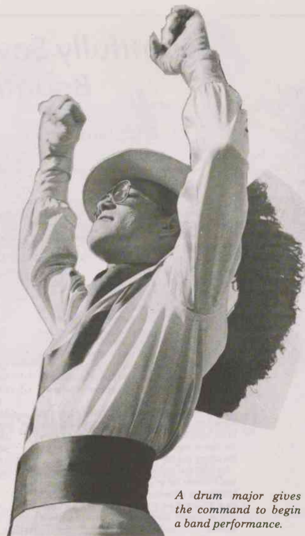
A drum major gives the command to begin a band performance.

Following the football game, Alpha Pi Epsilon, national honorary society for secretarial students, held a reunion for former members at the "Friendly Place," in front of Carrie Savage Camp Hall, the college's new science-engineering facility.