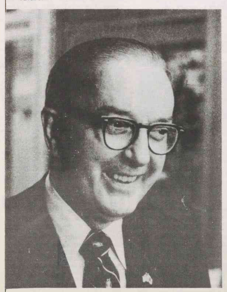
Senator Jesse Helms . . . Honored by Naming

The formal dedication of Chowan's new gymnasium-physical education center will be held at the site on Monday, September 1, 1980 at 10:30 a.m. Additional details will be mailed later. Please mark your calendars and plan to be present to participate in the formal dedication.