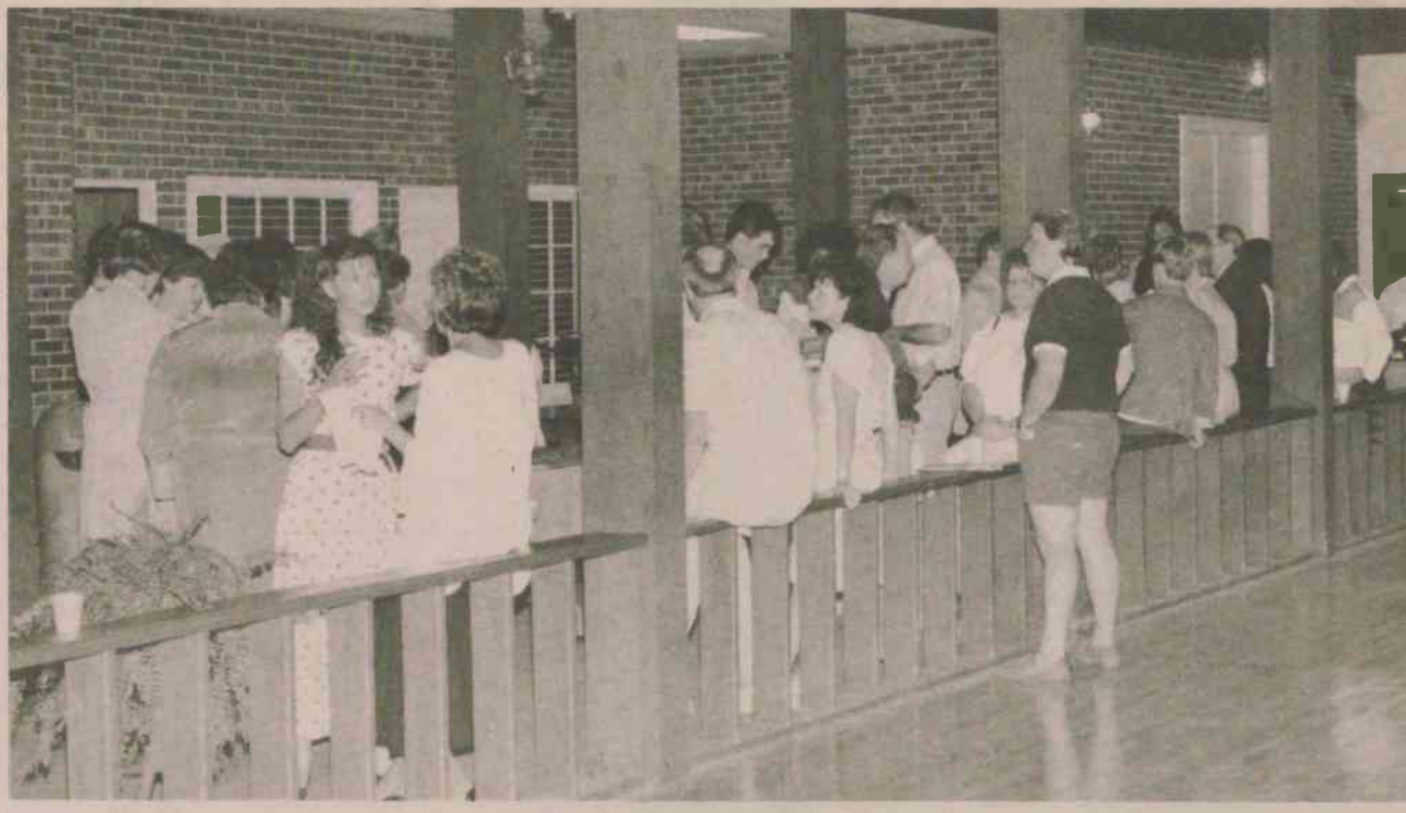
Beautiful, warm fall weather draped the campus in October when many parents and friends were on campus for the Parents' Day activities of the Fall Semester.

Students and their parents were honored at a reception in Lakeside Student Center and were greeted by the President of the College and other officials, along with faculty and staff. The parents then had an opportunity to visit with individual professors to learn of the academic progress of their sons and daughters in various classes.