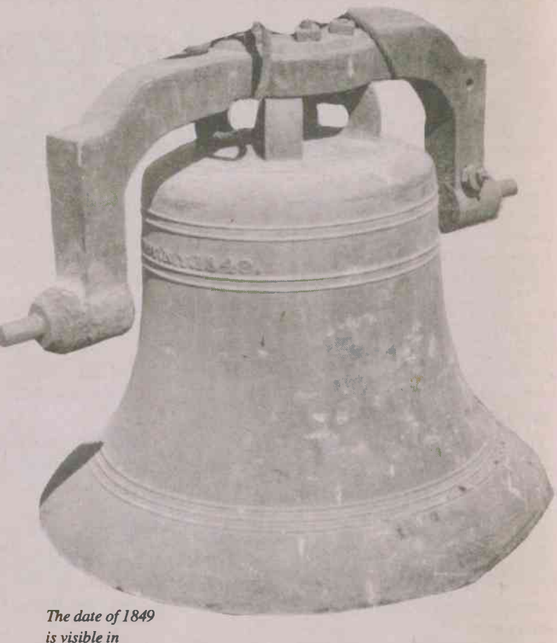
The date of 1849 is visible in the solid brass bell, which was housed in McDowell Columns' cupola for many years.