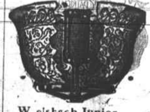
W. elsbach Junior.

A Welsbach Junior Lamp burns 2 feet of Gas per hour, and gives 50 Candle Power of Light, where an open tip burns 6 feet of Gas and gives 20 Candle Power. How much do you save?