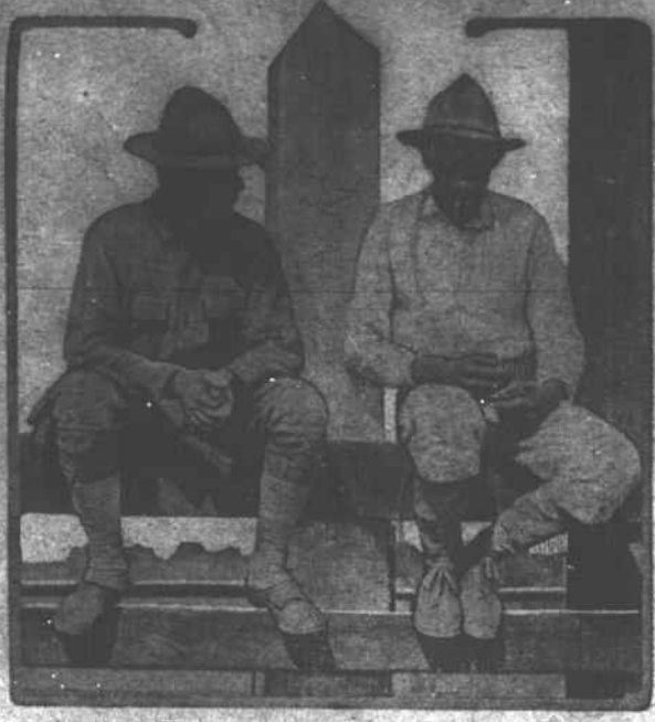
American regular and soldier of Carranza a army scated on the inte tional bridge at Brownsville, Tex, with the b