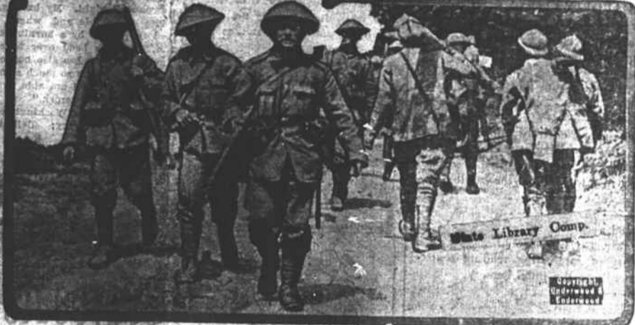
Scene in France where the British and French lines come together. English soldiers, on right, are going to the trenches and French troops, on left, are coming back from the fighting line.