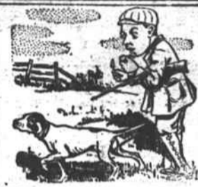
LET'S GIVE YOU A POINTER.

If you expect to do any hunting this year get a gun that will shoot where it points. Get the ammunition that never fails to explode too. Get them both here and you'll bring home a bag full as you can stuff it. We sell sporting goods that makes experts out of amateurs.