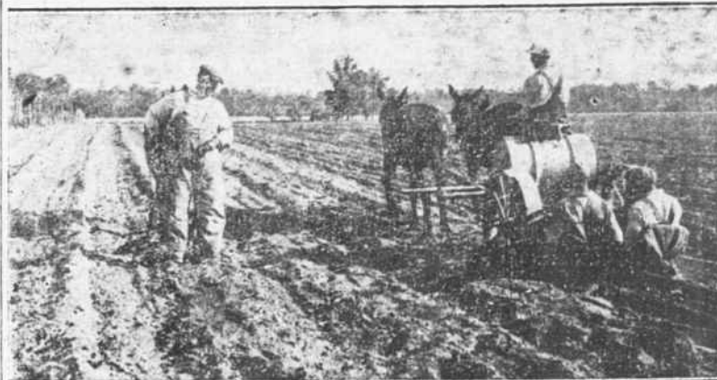
ACTUAL SCENE—Here may be seen an actual scene of the planting of a tobacco field early in the Spring.