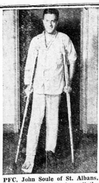
Vt., will tell you to buy all the War Bonds possible if only to repair physical damage of war. He's been through tough days as a result of a strafing by a Nazi dane in Europe.