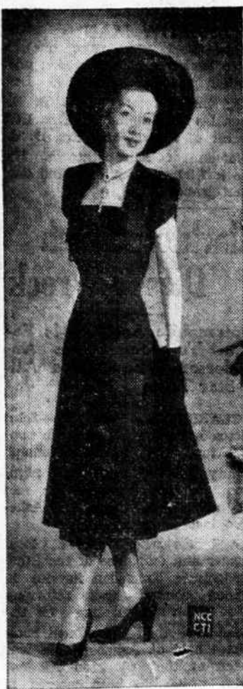
Exciting and sophisticated, this dark cotton is ideal for important occasions—an evening in town or a wedding in the country. It's available in black, brown, green, purple or navy, aqua, blue and pink. It is worn with a padra straw with Russian mesh veiling.