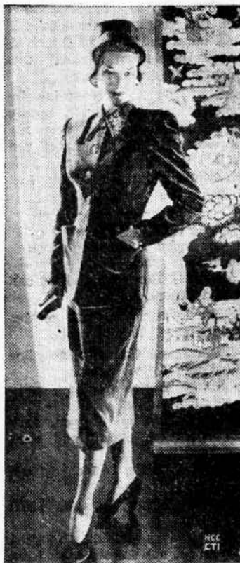
Reflecting the regal mood of autumn is this cotton velveteen designed by fashion creator Charles Armour in the new long enhancing silhouette. Golden emblems on the collar and buttons suggest the courtly crest of bygone days. The matching hat also is done in cotton velveteen.