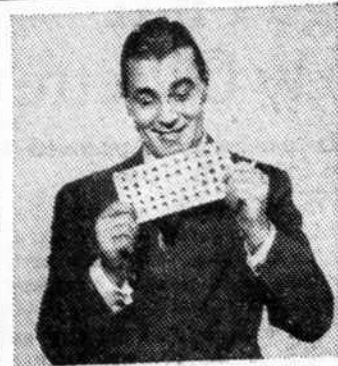
Every entry gets a certificate for the Family Sweepstakes

Right! Some lucky family is going to collar a cool $25,000 Cash! That's the grand pay off among 40 Family Sweepstakes Prizes in Pepsi-Cola's terrific "Treasure Top" Sweepstakes and Contests. It could be your family—every entry* you send in wins you points for the Family Sweepstakes Prizes. So enter often—get your whole family started! 51 Cash Prizes each month in your state—plus big Monthly National Prizes! Total Cash Prizes $203,725.00!