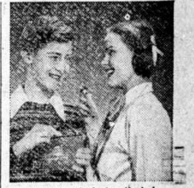
Get the whole family in!

How'd you like to win $25,000.00 cash? Here's your chance! Pepsi-Cola's great contests offer a top Family Sweepstakes Prize of $25,000.00—among swell cash prizes! Also, State and National cash prizes every month! Lots of chances to win! Enter this sensational new series of Pepsi-Cola contests. Enter often—every entry* gets a Treasure Certificate for the Family Sweepstakes Prizes. Contests close June 30, 1948