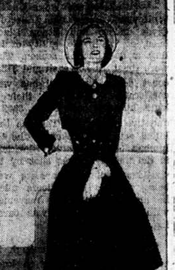
Bolero dress shown above as pictured in the April issue of Good Housekeeping magazine is ideal for travelling. Note the matador-high jacket, the embroidered cummerbund, the dropped neckline of the dress beneath. In green, navy, brown, or black; rayon; sizes 12 to 16; about $35. Carlyle dress, Duchess fabric.