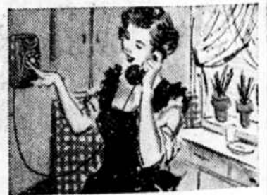
CONVENIENCE IN THE KITCHEN

SOUTHERN BELL TELEPHONE AND TELEGRAPH COMPANY