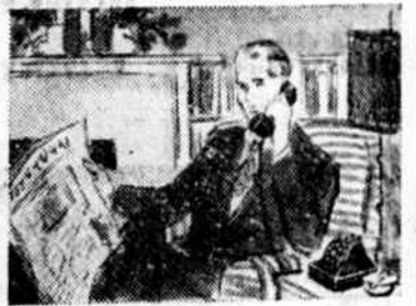
WITHIN EASY REACH OF ALL THE FAMILY

Orders for main telephone service are sometimes delayed because of shortages of central office and other equipment, which are not involved in the installation of extension telephones. That's why you can now get extension telephones, though there may still be delays in furnishing main telephone service.