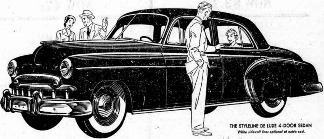
THE STYLELINE DE LUXE 4-DOOR SEDAN White sidewall tires optional at extra cost.

for full value...for a full view...and from every viewpoint