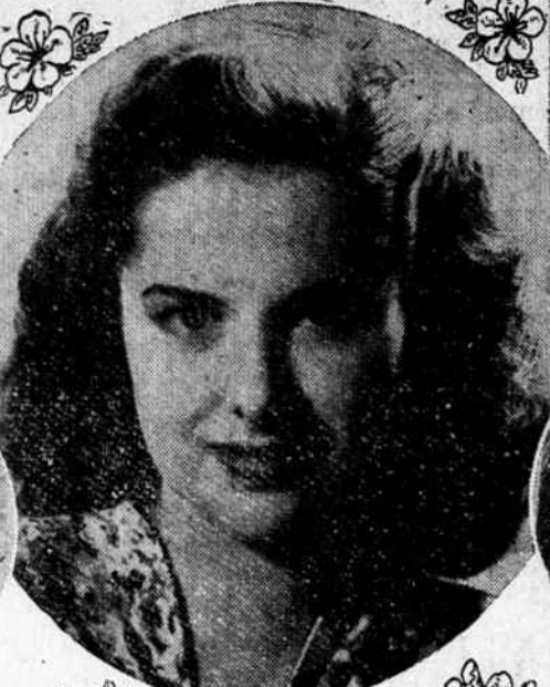
MARTHA HYER