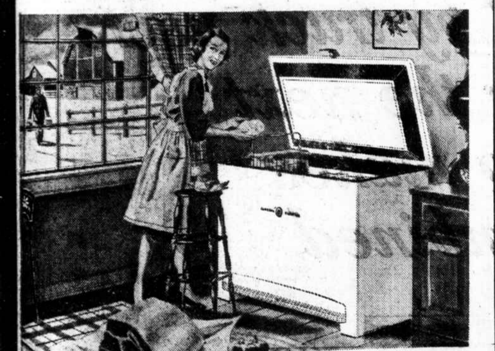
General Electric Home Freezers are available in 4- and 8-cu ft models. Immediate delivery.

1. You scald your vegetables. 2. Pack and seal them in sanitary, airtight containers. 3. Put them in your home freezer! And that's all! 4. Remove from the freezer.