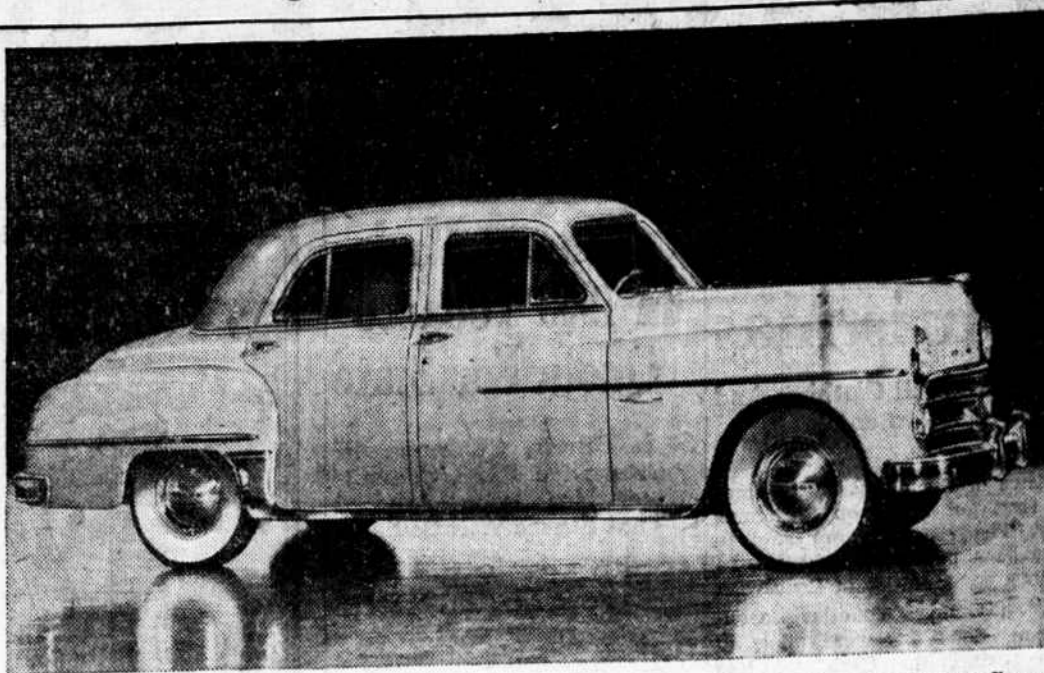
New body lines, larger rear window and fresh front end styling identify the new Dodge Coronet four-door sedan. The new Dodge line consists of ten body styles on two wheelbases. Coronet models, on a 123 1/2-inch wheelbase, are available with Gyro-Matic transmission, which frees the driver from shifting. Fluid Drive is standard equipment on all Dodge cars.