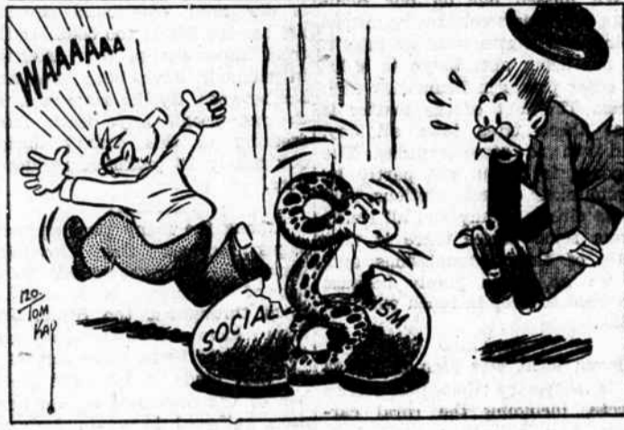
The Egg and You