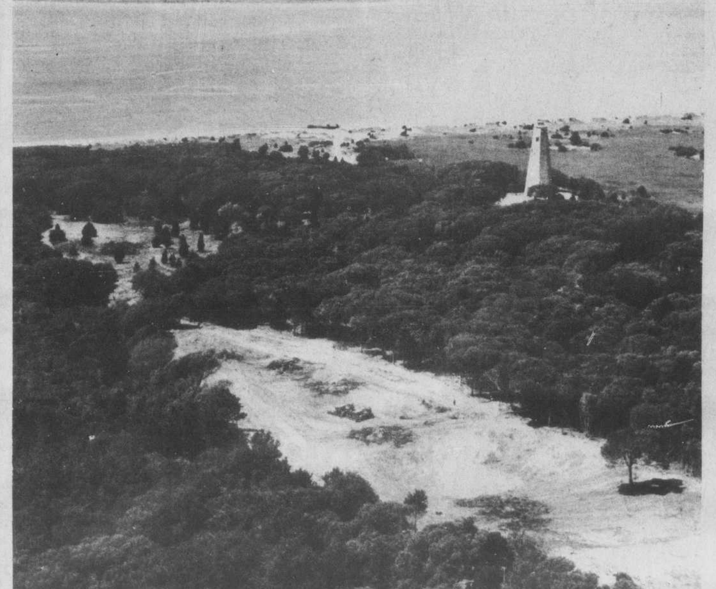
WORK IS WELL UNDERWAY on the 18-hole golf layout at Bald Head Island. This aerial photo by a staff photographer shows the fairway closest to the old lighthouse.