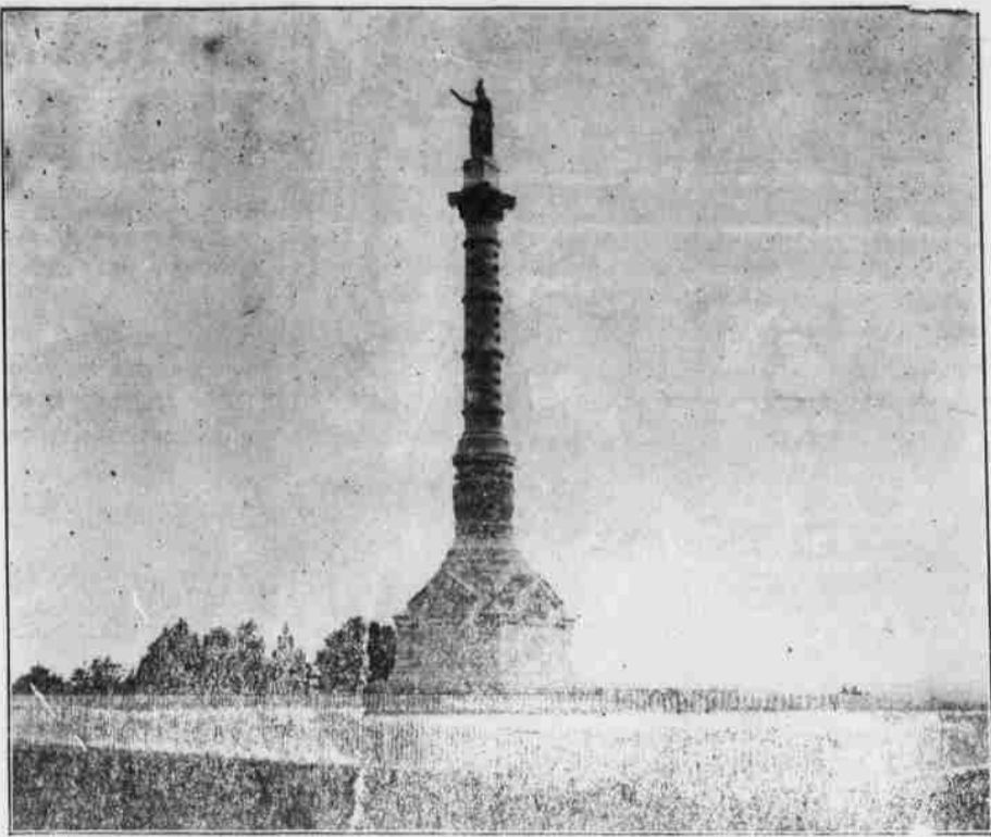
Yorktown Monument—Scene of Surrender of Cornwallis to Washington.

Its the man who can't earn a living that argues on how to finance the government.