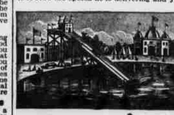
SHOOTING THE CHUTES AT CONY ISLAND, N. Y. can see every posture he makes. Boys, it is marvelous. The live boy with one of these machines can make plenty of money—all he wants to spend. Send coupon.

Every Home may be turned into a regular gold mine by giving moving picture shows. For instance there is no one who would not be willing to pay to see President Roosevelt delivering one of his speeches. It is so real you can almost hear the words and all one has to do is to read the speech he is delivering and you