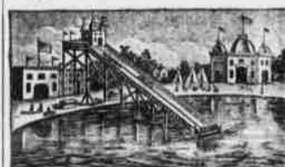
SHOOTING THE CUTS AT COSTLY ISLAND, N. Y. CAN SEE EVERY POSTURE he makes. Boys, it is marvelous. The boy with one of these machines can make plenty of money—all he wants to spend. Send coupon.

Every home may be turned into a regular picture show. For instance there is no one who would not be willing to pay to see President Roosevelt delivering one of his speeches. It is so real you can almost hear the words and all one has to do is to read the speech he is delivering and you