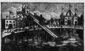
SHOOTING THE CHUTES AT CONEY ISLAND, N. Y.

Every Home may be turned into a regular picture show. For instance there is no one who would not be willing to pay to see President Roosevelt delivering one of his speeches. It is so real you can almost hear the words and all you have to do is to read the speech he is delivering and you