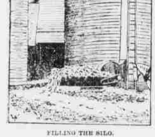
FILLING THE SILO.

Power should be ample and in proportion to the size of the cutter. The blower is replacing the elevator machine, economizing space and largely doing away with the stopping of an entire crew to repair the elevator.