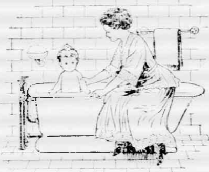
"Standard" "Occident" Bath

When desired we can furnish a low height closet for the children and child's bath for the baby. For the latest and best in plumbing fixtures as well as the best workmanship, consult us. No charge for estimates.