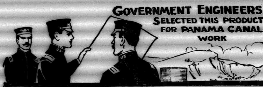
GOVERNMENT ENGINEERS SELECTED THIS PRODUCT FOR PANAMA CANAL WORK

NEPONSET Paroid Roofing is the most reliable and longest lasting roof ever made. It is made of the finest materials and is guaranteed to last for many years. It is also fireproof and does not rot or decay. It is the best roof for all kinds of buildings. Farmers everywhere are using NEPONSET Paroid Roofing and are getting the most for their money. Buy NEPONSET Paroid Roofing today and you will be satisfied.