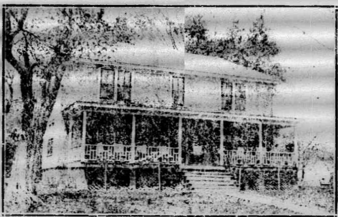
BEECH NUT BOARDING HOUSE

The accompanying picture shows Beech Nut, the 11-room boarding house which Miss Virginia Allison has conducted on the Asheville road 2 miles from Brevard for about 10 years.