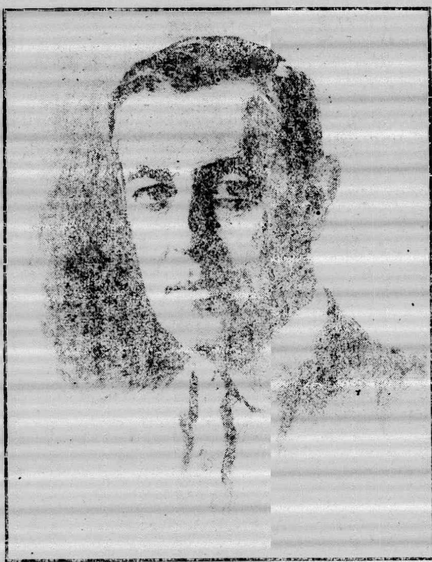
PRESIDENT WOODROW WILSON