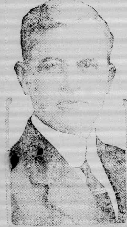
C. K. NIMOCKS Fayetteville, N. C. Democratic Candidate for Congress from the 6th District