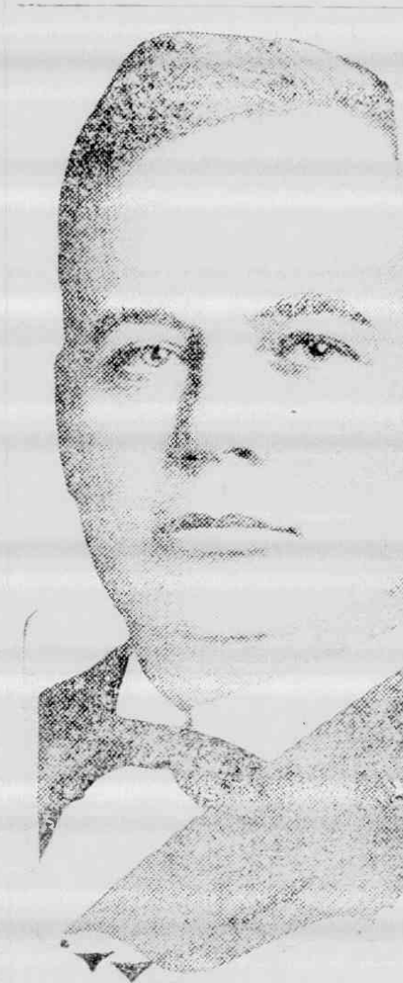
THOMAS W. BICKEETT, Governor-Elect of North Carolina.

Raleigh, N.C., Nov. 10.—The results from the vote in nearly all of the state, the estimated popular vote has been amended and it is practically sure that the Democrats will lead in North Carolina by over 50,000 votes. Two counties heard from today.