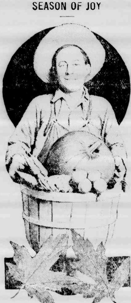
"When the frost is on the pumpkin and the feller's in the shock."

KODAKS & SUPPLIES We also have highest class of finishing Plates and Catalogue upon request.