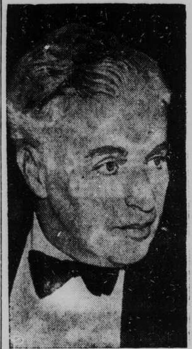
CHARLIE CHAPLIN, white-haired actor, is being tried this week on charges of violation of the Mann act. He is being sued by his ex-protege, Joan Berry, who accuses that Chaplin is the father of her child.