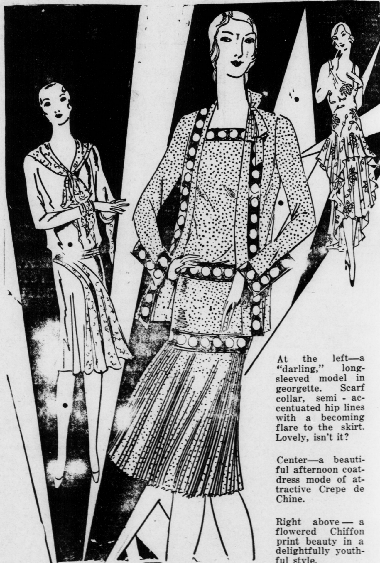
At the left—a "darling," long-sleeved model in georgette. Scarf collar, semi-accentuated hip lines with a becoming flare to the skirt. Lovely, isn't it?