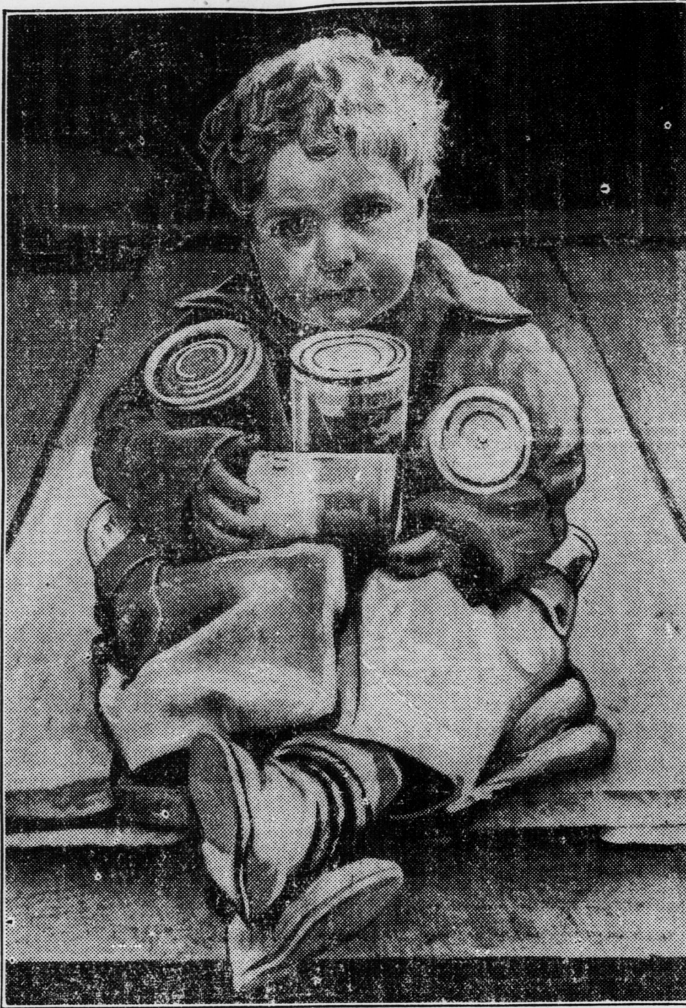
This baby in a drought stricken section of West Virginia was one of the ultimate consumers of the foodstuffs given by the American Red Cross in the past year. More than 2,750,000 persons were fed by the organization.

to keep in touch with the home town. If you don't think this is a valuable and appreciated service, ask some of the boys and girls away at college. Or one of the boys in the Marines or Navy.